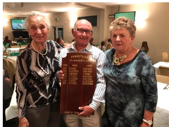
Left to right: Summer Cup Winners

FootGolf is starting to attract more players as the weather cools. The Course is looking magnificent.