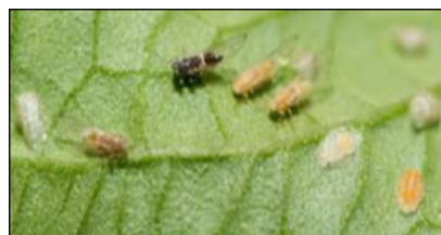
Tomato potato psyllid adults and nymphs on the back of a leaf

has been detected for the first time in Australia – here in Perth!